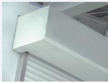
箱罩 (折板式) Box cover(Passbook Plate) Elaborate design and manufacture of fold board type box cover, installing the blackout emergency locks on the bottom, can enhance the safety and convenient for your standard management. Making the whole door appear more beautiful, neat and practical. And during power outage or emergency situations can be manually open, avoid to cause unnecessary losses and consequences.