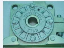
防坠落保护装置 Box cover(Passbook Plate) Elaborate design and manufacture of fold board type box cover, installing the blackout emergency locks on the bottom, can enhance the safety and convenient for your standard management. Making the whole door appear more beautiful, neat and practical. And during power outage or emergency situations can be manually open, avoid to cause unnecessary losses and consequences.