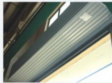
箱罩 (门片式) Box cover(gate chip) Elaborate design and manufacture of door chip box cover, installing the blackout emergency locks on the bottom, can enhance the safety and convenient for your standard management. Makes the whole door appear more beautiful, neat and practical. And during power outage or emergency situations can be manually open, avoid to cause unnecessary losses and consequences.